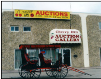
Cherry Hill Auctions highlights Surrey Carriage with the Fringe on Top!