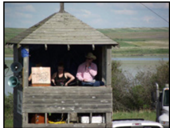
Another rodeo the Johnston team provides a superb coverage on all the competitions.