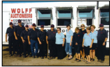
The Wolff Auction Team - Their reputation created a large following in the Alberta Market: Highly Recommended

I have been retired for three years and it is the best job I ever had. I even get along real well with my "boss" with whom I'll be celebrating fifty years in 2020.