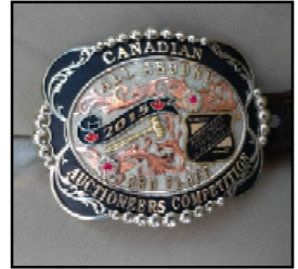
Placing 3rd at the 2015 Canadian Auctioneers Competition. A belt buckle he cherishes.