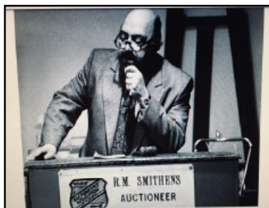
A fore runner in serving the Antique and Art Industry in Alberta 1979 AA of Alberta President

I worked at my first auction sale as a 'runner' in 1963 at the age of 8 years old. Many years later, I still love the thrill of the marketplace in action !